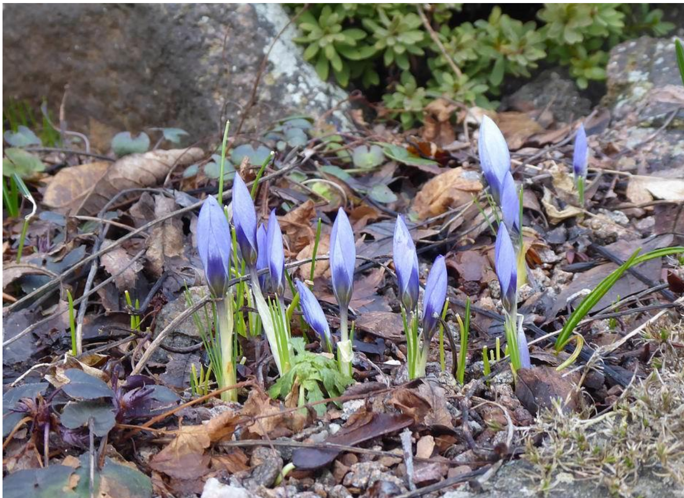
The first of the crocus flower in the garden such as Crocus abantensis are always among the first to appear.