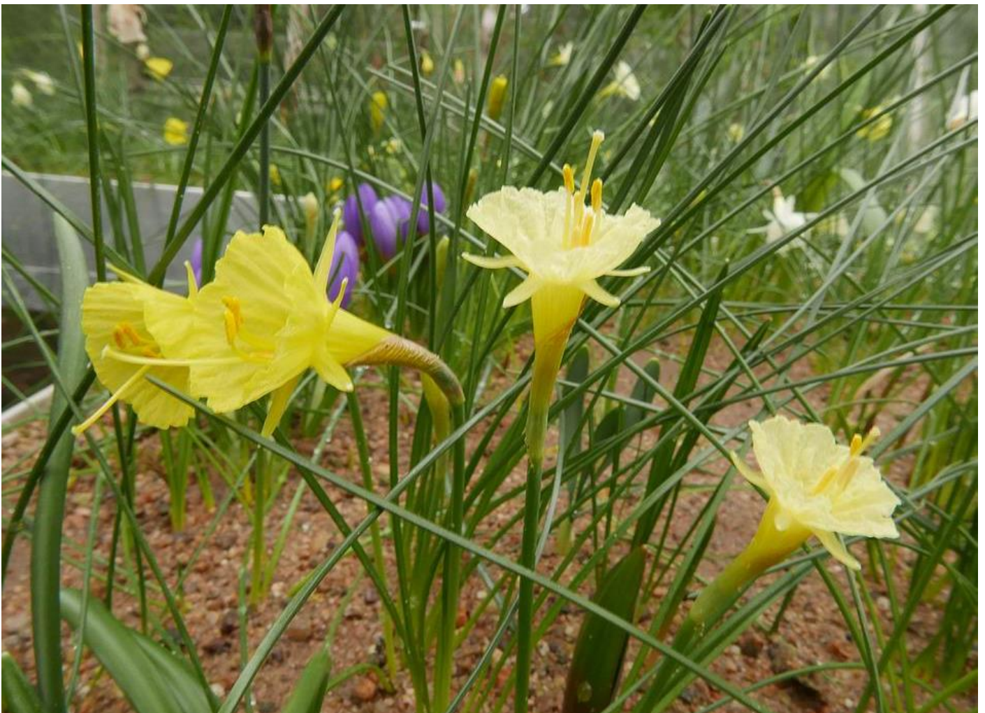
Narcissus bulbocodium seedling on the left with the upward facing Narcissus romieuxii rifanus on the right.