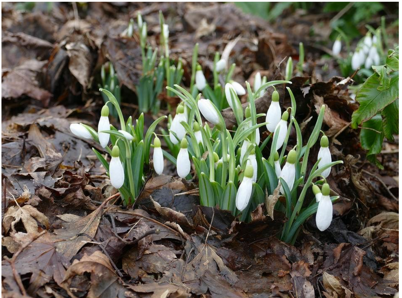
Galanthus plicatus seedlings.

Singly planted bulbs soon form clumps like this pushing through the mulch of fallen leaves which also serve to improve the soil as they break down.