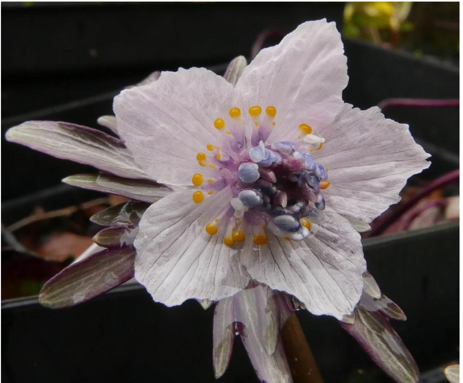
Seedling ex Eranthis pinnatifida, Soryo-Cho Hiroshima.

Looking down on these two clones of Eranthis pinnatifida shows more clearly the difference in colour and size.