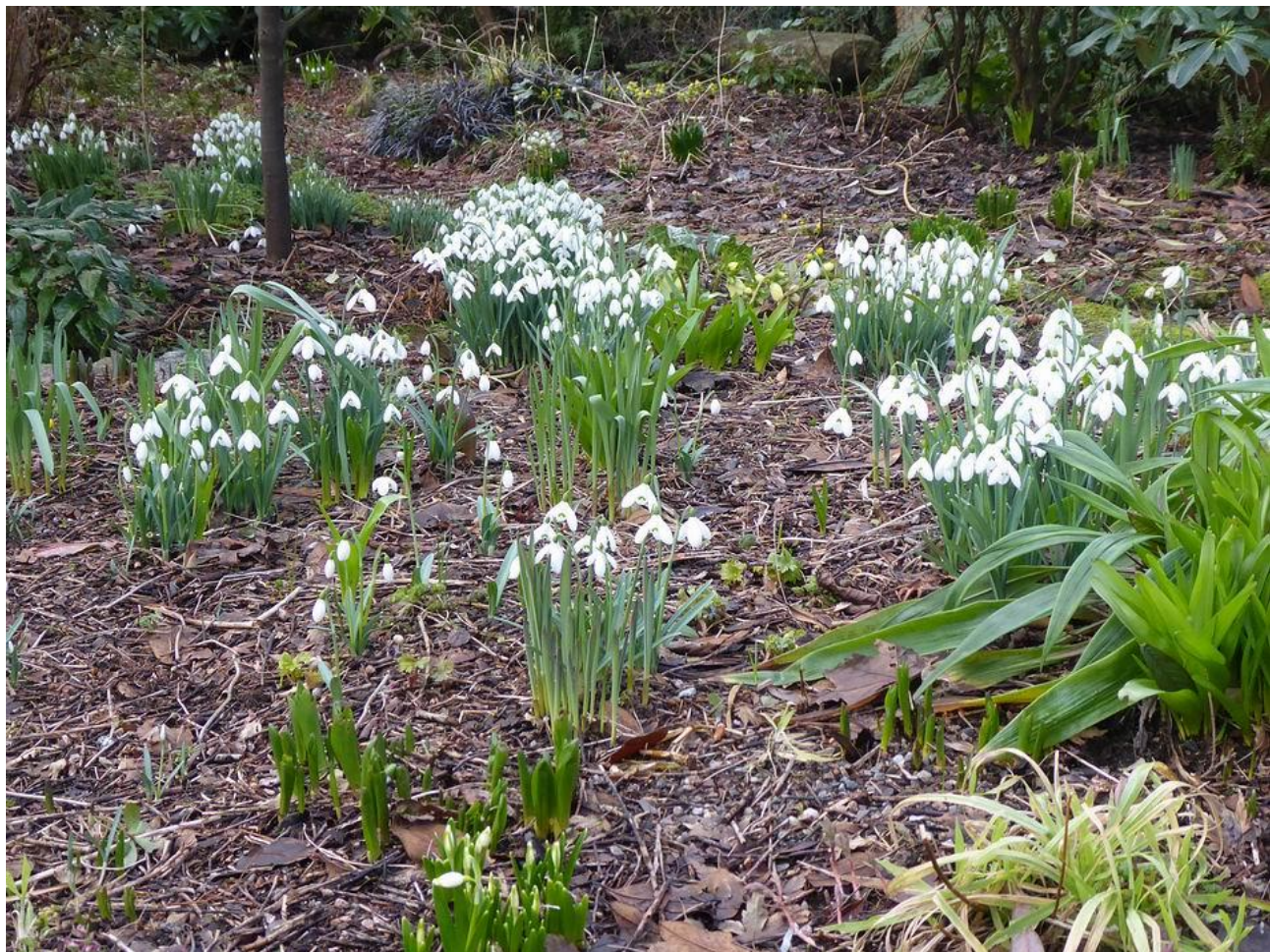
As if from nowhere clumps of snowdrops are now appearing.