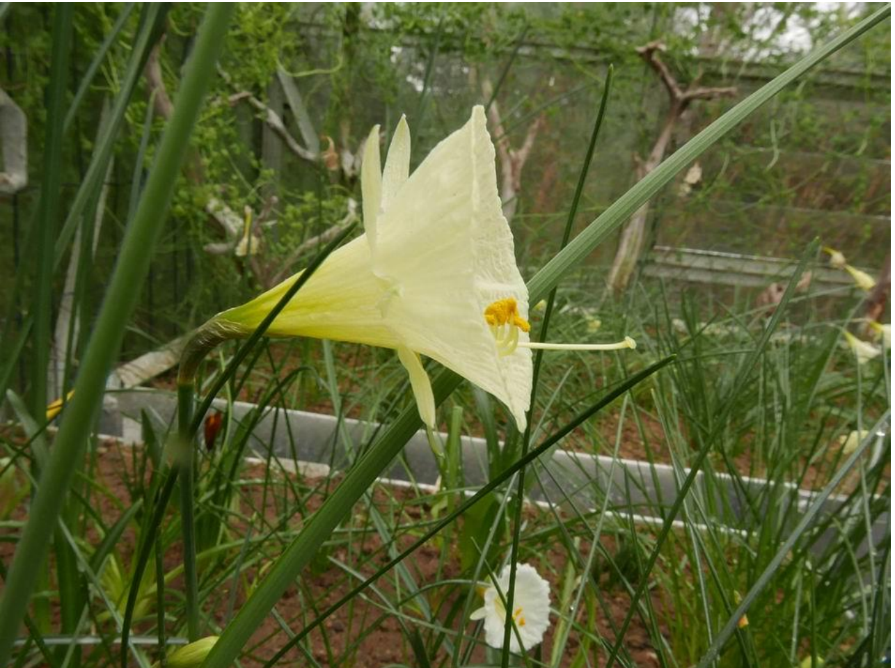
Narcissus romieuxii seedling

Many of the plants that we originally received as Narcissus romieuxii may well have been naturally occurring hybrids which when they are brought together in a small glasshouse with other forms and species cross freely producing the wide variation of flowers that we see; most of which are fertile.