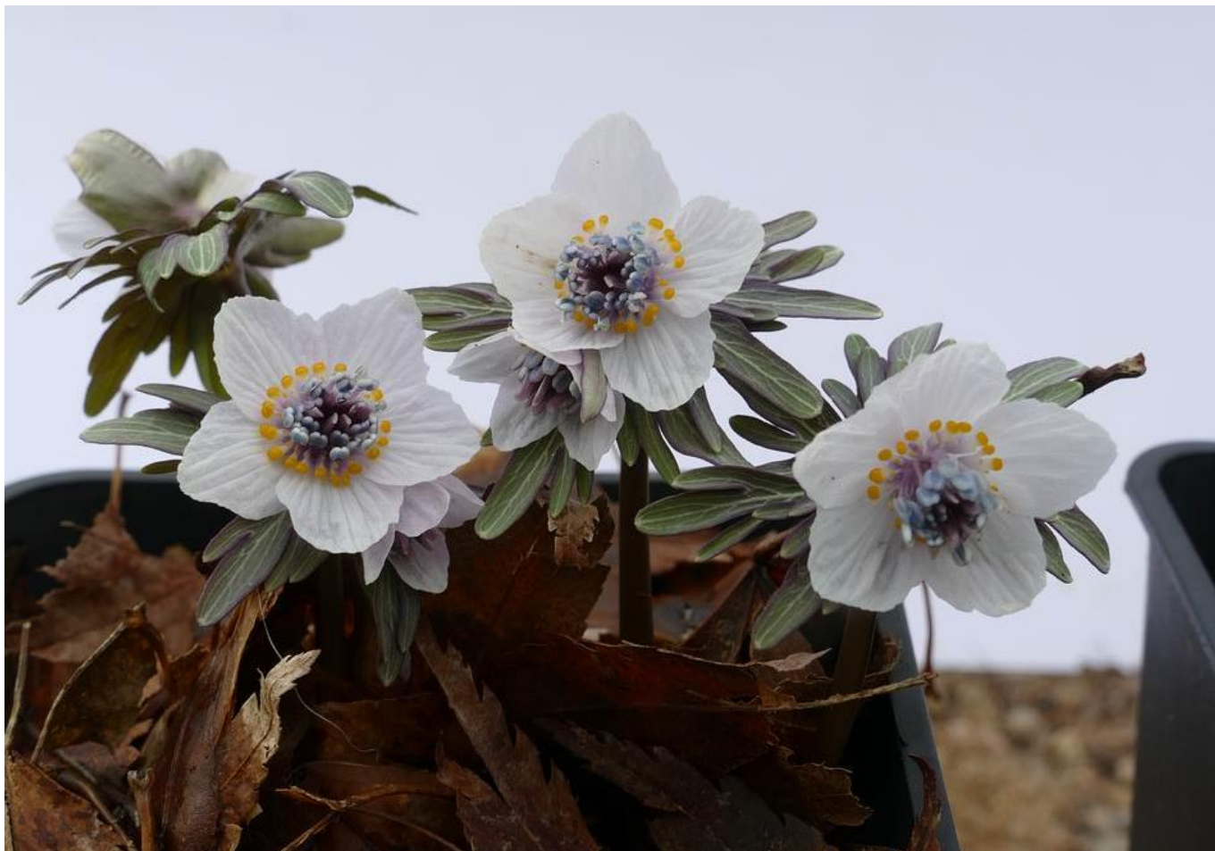
Eranthis pinnatifida , Soryo-Cho Hiroshima

The soft pinkness of the flowers has been washed out by the exposure in this picture but the deep colouration can be seen in the leaves and the stems. I find this the most attractive of all the forms that I have seen. Notice that when growing well a secondary flower can grow below the primary one.