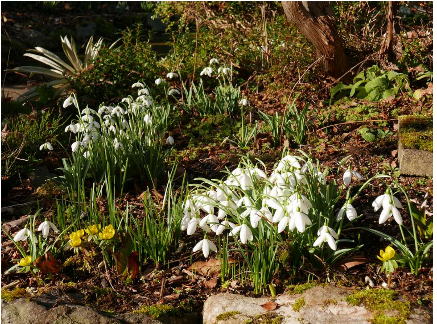
Galanthus and Eranthis enjoying the sunshine for the first time this year.