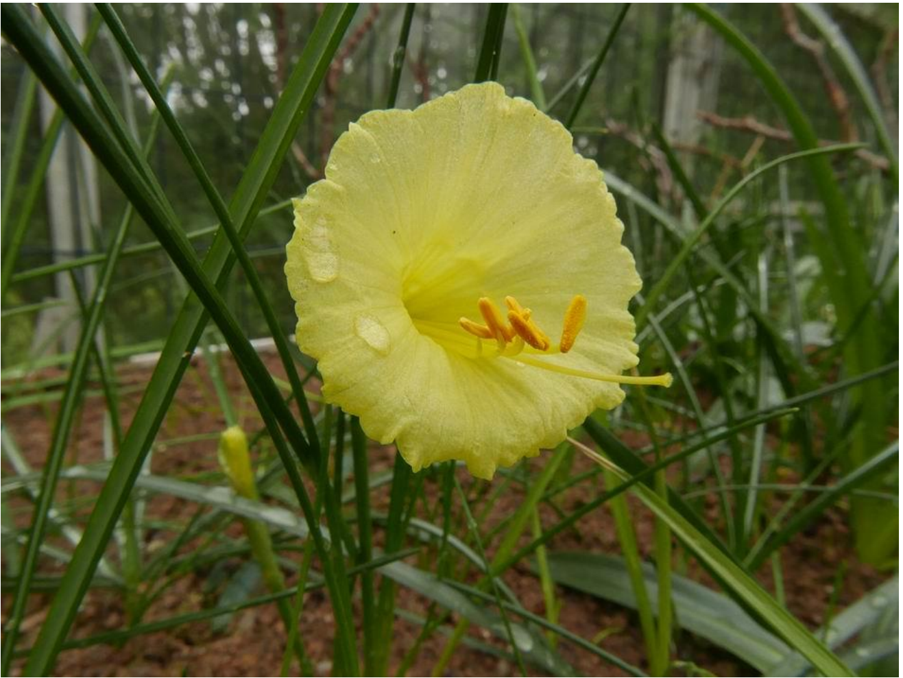
Narcissus romieuxii seedling