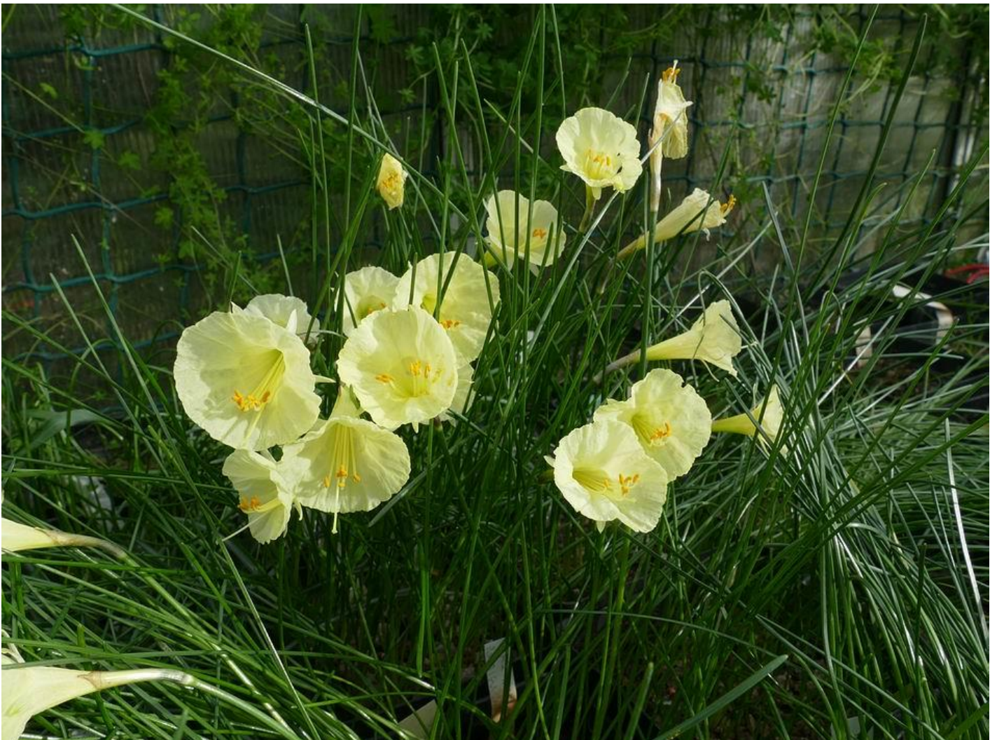
The bulbs growing in pots such as Narcissus romieuxii 'Craigton Clumper' were also watered and fed this week.